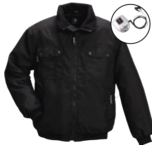
SANTANDER PILOT JACKET 03022-011

65% polyester / 35% cotton. 320 g/m 2 canvas with stretch. Jacket with lining and detachable hood. Wire passages for headset. Size XS-4XL. Navy, khaki, black and anthracite.