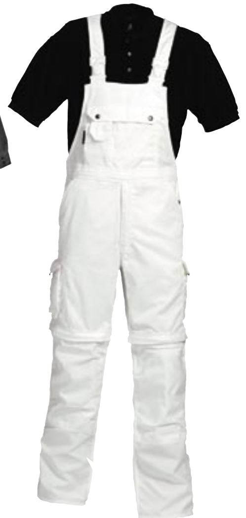
BILBAO BIB & BRACE 03169-010

100% polyester. 290 g/m 2 . Pilot jacket in breathable, wind and waterproof Mascotex® canvas with detachable quilted lining and fleece collar. Wire passages for headset. Certified according to ENV343. Size XS–4XL. Navy, khaki, white, black and anthracite.