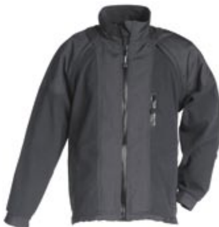
CORIA FLEECE JACKET 04042-740

65% polyester / 35% cotton. 320 g/m 2 canvas with stretch. Work trousers reinforced with Cordura®. Size C42–C72. Inner seam 82 (32") and 90 cm (35"). Navy, khaki, white, black, royal and anthracite.