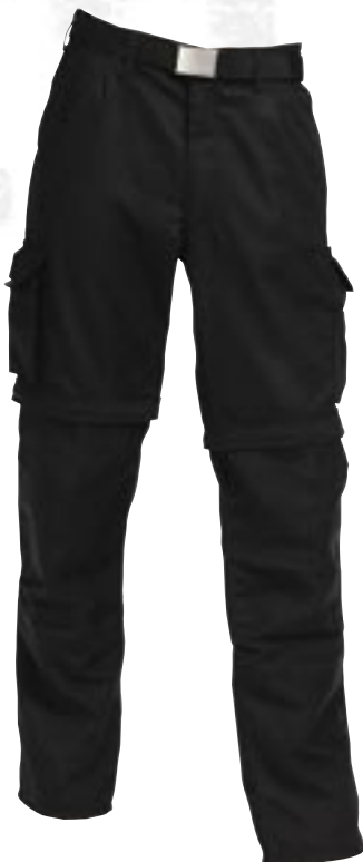
CADIZ WORK TROUSERS 03179-010

50% polyester / 50% cotton. 200 g/m 2 canvas. Long-sleeved work shirt with concealed button-down collar. Extra long and loose. Collar size 37/38 - 49/50 cm. Navy, khaki, white, black, royal and anthracite.