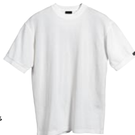
PALMA T-SHIRT 03082-026

Many tests preceded the launch of MASCOT® HARDWEAR. The goal was to design a new product that would meet today's needs in every respect. MASCOT's test panel, which included workmen from different professions, made an important contribution to MASCOT® HARDWEAR's success. The members of the test panel helped develop the product and granted the final seal of approval.