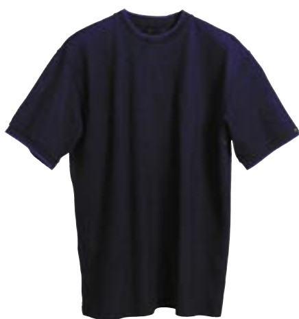
PALMA T-SHIRT 03082-026