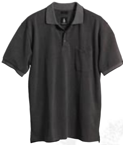
VALENCIA POLO SHIRT 03083-026

60% cotton / 40% polyester. 220 g/m 2 . Short-sleeved polo shirt in strong piqué. Size S–4XL. Navy-flecked, khaki-flecked, white, black and anthracite-flecked.