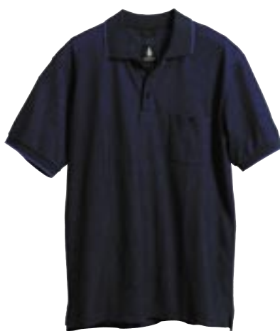
VALENCIA POLO SHIRT 03083-026

60% cotton / 40% polyester. 220 g/m 2 . Short-sleeved T-shirt in strong piqué. Size S-4XL. Navy-flecked, khaki-flecked, white, black and anthracite-flecked.