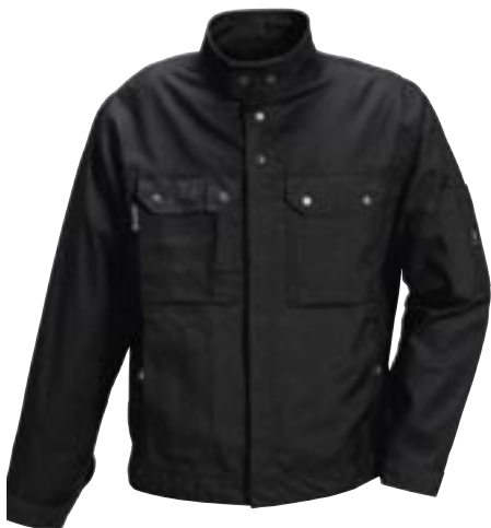
GERONA WORK JACKET 03009-010

65% polyester / 35% cotton. 320 g/m 2 canvas with stretch. Work jacket reinforced with Cordura®. High collar with press stud buttons. Cord holder for headset. Adjustable waist. D-ring for additional click-fit pouches. Size XS-4XL. Navy, khaki, white, black, royal and anthracite.