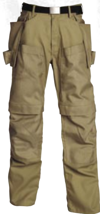
LORCA CRAFTSMAN'S TROUSERS 04031-010

65% polyester / 35% cotton. 320 g/m 2 canvas with stretch. Zip-off work trousers with adjustable knee pad pockets and reinforced with Cordura®. Size C42-C72. Inner seam 82 (32") and 90 cm (35"). Navy, khaki, white, black, royal and anthracite.