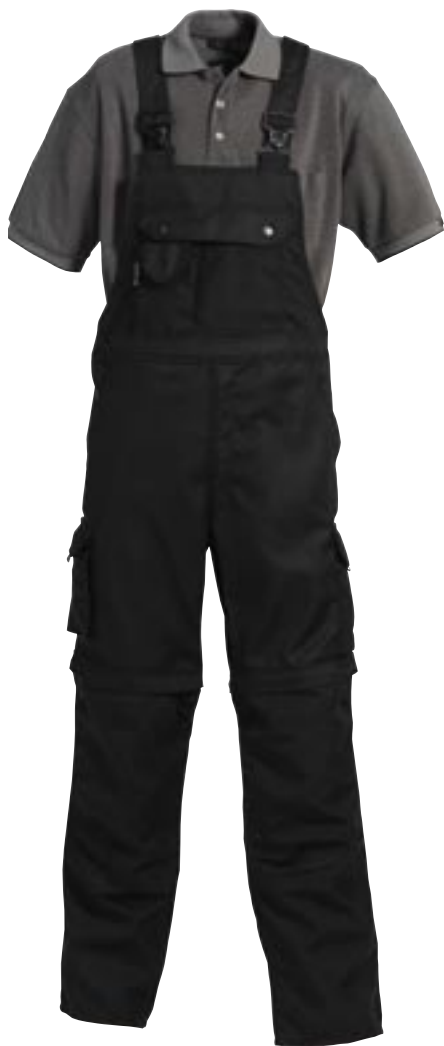
BILBAO BIB & BRACE 03169-010

65% polyester / 35% cotton. 320 g/m 2 canvas with stretch. Jacket with lining and detachable hood. Wire passages for headset. Size XS-4XL. Navy, khaki, black and anthracite.