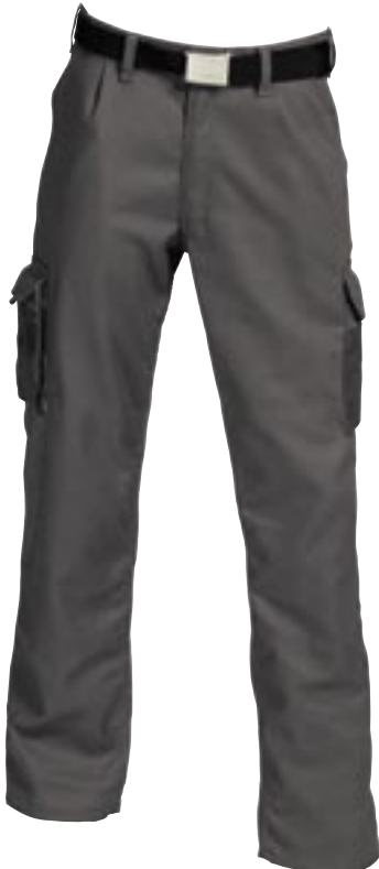
TOLEDO WORK TROUSERS 03079-010

65% polyester / 35% cotton. 320 g/m 2 canvas with stretch. Zip-off bib & brace with adjustable knee pad pockets, reinforced with Cordura®. Adjustable waistband (5 cm; 1.97 inches). Size C42–C72. Inner seam 82 (32") and 90 cm (35"). Navy, khaki, white, black, royal and anthracite.