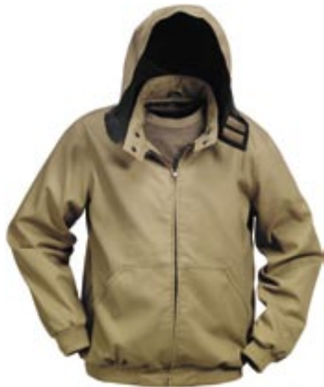
GRANADA JACKET 03109-010

65% polyester / 35% cotton. 320 g/m 2 canvas with stretch. Jacket with lining and detachable hood. Wire passages for headset. Size XS-4XL. Navy, khaki, black and anthracite.