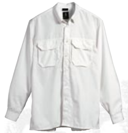
BARCELONA WORK SHIRT 03004-024

100% Cordura®. 320 g/m 2 . Water-repellent pilot jacket in Cordura® with quilted lining and fleece collar. Wire passages for headset. Size XS–4XL. Navy, khaki, white, black, royal and anthracite.