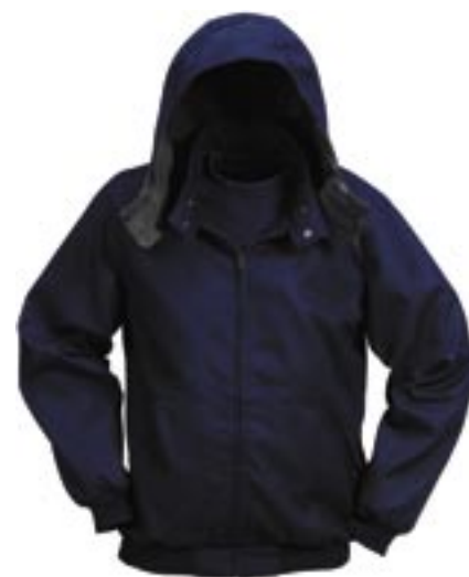
GRANADA JACKET 03109-010

60% cotton / 40% polyester. 220 g/m 2 . Short-sleeved polo shirt in strong piqué. Size S-4XL. Navy-flecked, khaki-flecked, white, black and anthracite-flecked.