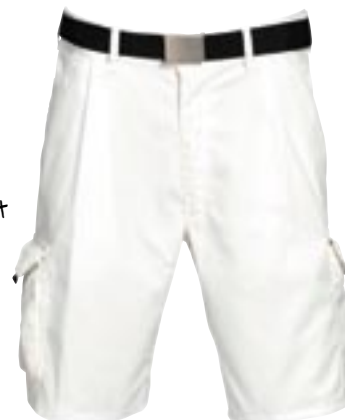
MALAGA WORK SHORTS 03049-010

65% polyester / 35% cotton. 320 g/m 2 canvas with stretch. Craftsman's trousers with adjustable knee pad pockets, reinforced with Cordura®. Ergonomically cut legs for use with knee pads. Detachable hanging pockets in Cordura® with area at the back for hip pads. Size C42-C72. Inner seam 82 (32") and 90 cm (35"). Navy, khaki, white, black and anthracite.