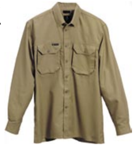
BARCELONA WORK SHIRT 03004-024

MASCOT® HARDWEAR is more than just workwear. MASCOT® HARDWEAR is a new style that combines elements from modern leisurewear with the latest demands for strong and functional workwear. The result is an advanced, stylish collection of products that meet the need for carefully considered workwear that is a joy to wear and a pleasure to look at.