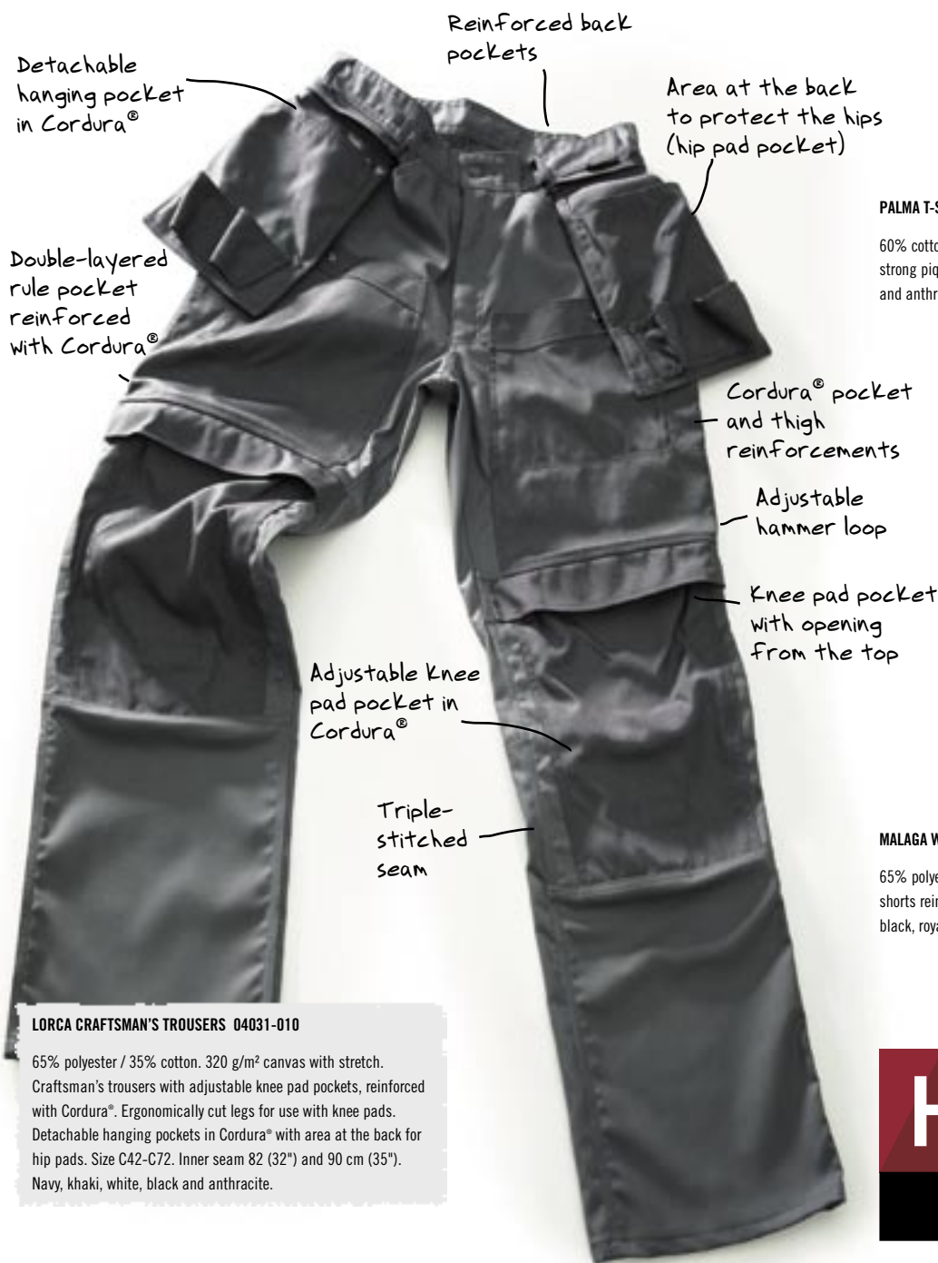
LORCA CRAFTSMAN'S TROUSERS 04031-010

60% cotton / 40% polyester. 220 g/m 2 . Short-sleeved T-shirt in strong piqué. Size S-4XL. Navy-flecked, khaki-flecked, white, black and anthracite-flecked.