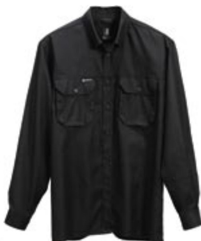
BARCELONA WORK SHIRT 03004-024

50% polyester / 50% cotton. 200 g/m 2 canvas. Long-sleeved work shirt with concealed button-down collar. Extra long and loose. Collar size 37/38 - 49/50 cm. Navy, khaki, white, black, royal and anthracite.