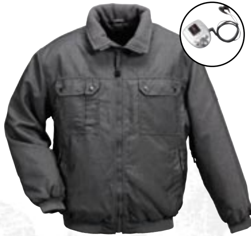
SANTANDER PILOT JACKET 03022-011

60% cotton / 40% polyester. 220 g/m 2 . Short-sleeved polo shirt in strong piqué. Size S–4XL. Navy-flecked, khaki-flecked, white, black and anthracite-flecked.