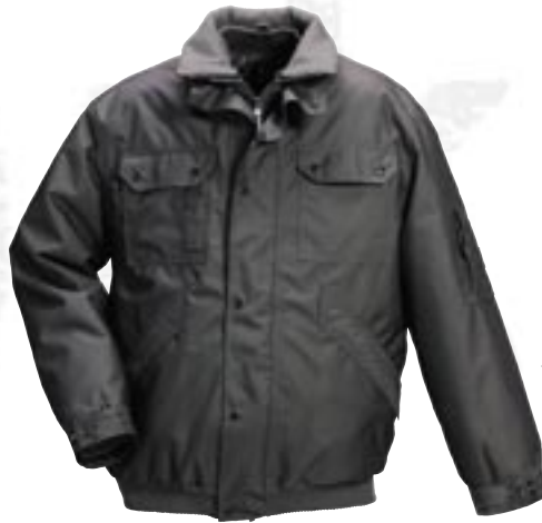
SEVILLA PILOT JACKET 03035-025

50% polyester / 50% cotton. 200 g/m 2 canvas. Long-sleeved work shirt with concealed button-down collar. Extra long and loose. Collar size 37/38 - 49/50 cm. Navy, khaki, white, black, royal and anthracite.