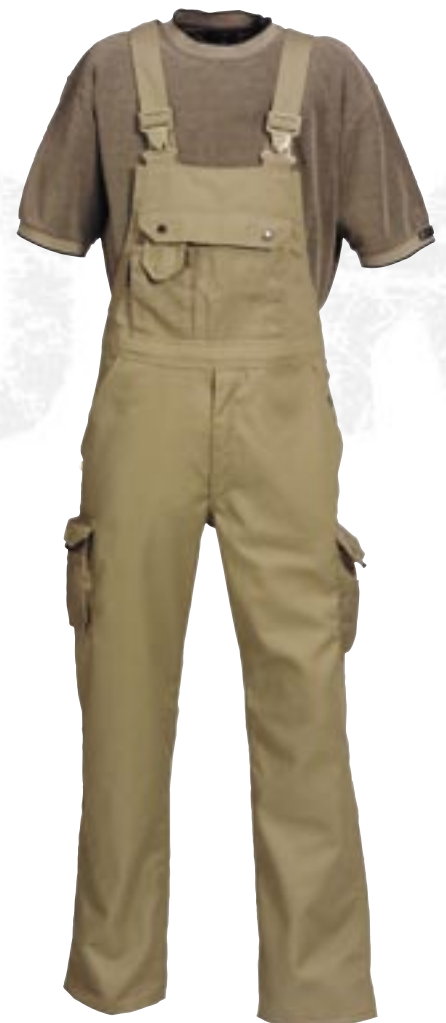
BURGOS BIB & BRACE 03069-010

65% polyester / 35% cotton. 320 g/m 2 canvas with stretch. Craftsman's trousers with adjustable knee pad pockets, reinforced with Cordura®. Ergonomically cut legs for use with knee pads. Detachable hanging pockets in Cordura® with area at the back for hio pads. Size C42-C72. Inner seam 82 (32") and 90 cm (35"). Navy, khaki, white, black and anthracite.