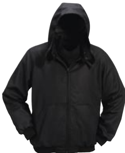
GRANADA JACKET 03109-010

65% polyester / 35% cotton. 320 g/m 2 canvas with stretch. Work jacket reinforced with Cordura®. High collar with press stud buttons. Cord holder for headset. Adjustable waist. D-ring for additional click-fit pouches. Size XS-4XL. Navy, khaki, white, black, royal and anthracite.