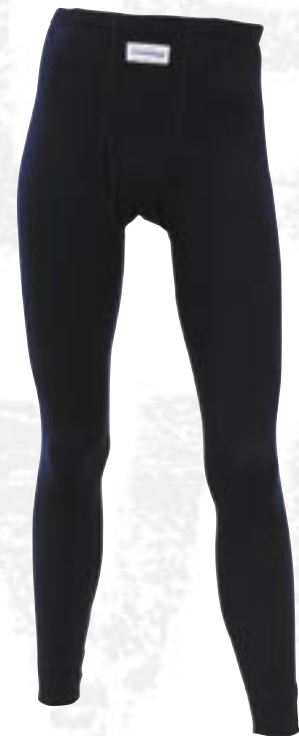
ALTA THERMAL UNDER TROUSERS 00572-350

100% polyester. 190 g/m 2 . Single-layer thermal under trousers made of CoolMax®, without fly. Size S-3XL. Navy.