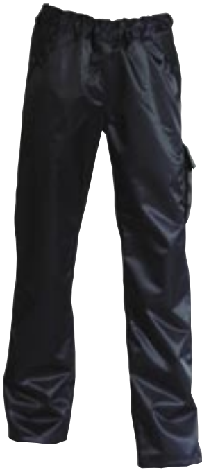
WOLFURT OUTER TROUSERS 07190-650

100% polyester. 225 g/m 2 . Outer trousers in breathable, wind and waterproof Mascotex® with lining and taped seams. Certified according to ENV343. Size S-4XL. Inner seam 82 cm (32"). Navy.