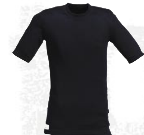
KALIX THERMAL UNDERSHIRT 00597-350

100% polyester. 190 g/m 2 . Single-layer thermal undershirt made of CoolMax® with round neckline and short sleeves. Size S-3XL. Navy.