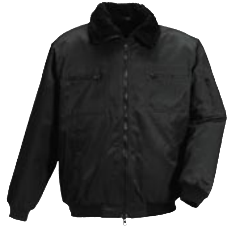
ALASKA PILOT JACKET 00516-620

60% cotton/ 40% nylon. 240 g/m 2 . Parka in water-repellent Bearnylon® with quilted lining and pile collar. Detachable hood with quilted lining. Size XS-4XL. Navy, bottle green, black and royal.