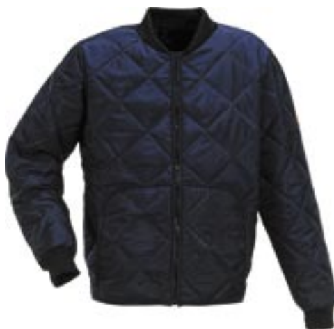
LONDON THERMAL JACKET 00515-450

95% polyester / 5% acrylic. 370 g/m 2 . Climatic pile jacket that zips right through. Contrasting water-repellent Bearnylon® reinforcement at shoulders, outside collar, elbows and side pockets. Windproofed lining at sleeves. Size XS-4XL. Grey/navy, grey/red, grey/royal.