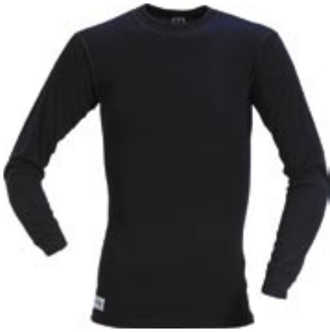
KIRUNA THERMAL UNDERSHIRT 00573-350

100% polyester. 190 g/m 2 . Single-layer thermal undershirt made of CoolMax® with round neckline and long sleeves. Size S-3XL. Navy.