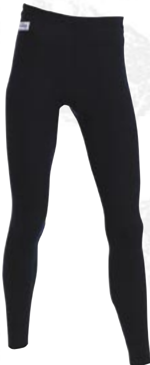
MORA THERMAL UNDER TROUSERS 00583-350

100% polyester. 190 g/m 2 . Single-layer thermal undershirt made of CoolMax® with round neckline and short sleeves. Size S-3XL. Navy.