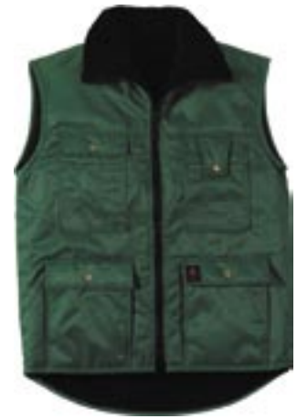
SÖLDEN WINTER BODYWARMER 00554-620

60% cotton/ 40% nylon. 240 g/m 2 . Parka in water-repellent Bearnylon® with detachable quilted lining. Detachable hood with quilted lining. Size XS-4XL. Navy.