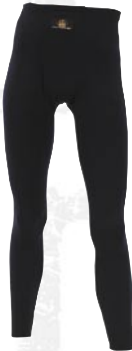
ARLANDA THERMAL UNDER TROUSERS 00586-380

55% polyester / 23% modal / 22% cotton. 260 g/m 2 . Triple-layer thermal undershirt made of Thermax® with round neckline and long sleeves. Size S-3XL. Navy.