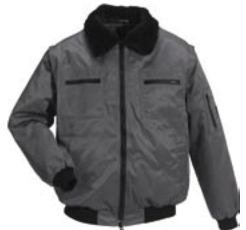
INNSBRUCK MULTI-PURPOSE JACKET 00520-620

60% cotton/ 40% nylon. 240 g/m 2 . Pilot jacket in water-repellent Bearnylon® with pile lining, pile collar and quilted sleeve lining. Two zipped breast pockets and zipped sleeve pocket. Size XS-5XL. Navy, red, bottle green, khaki, white, black and royal.