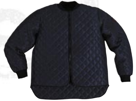
BERGEN THERMAL JACKET 00501-300

100% polyester. 250 g/m 2 . Quilted thermal bodywarmer with rear protection and high collar. Two large front pockets. Size XS-4XL. Navy.