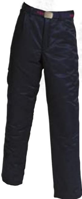
SIBIRIEN WINTER TROUSERS 00590-620

60% cotton/ 40% nylon. 240 g/m 2 . Winter trousers in water-repellent Bearnylon® with quilted nylon lining. Two side pockets and back pockets. Size S-3XL. Inner seam 82 cm (32"). Navy.