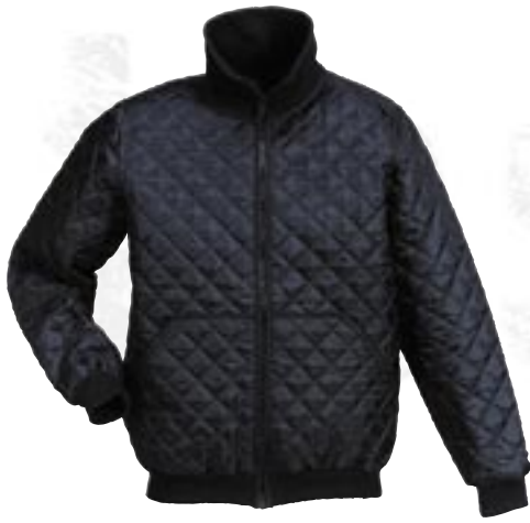
DUNDEE THERMAL JACKET 00525-590

100% polyester. 250 g/m 2 . Quilted thermal jacket with rear protection and high collar in ribbed knit. Two large front pockets. Size XS-4XL. Navy.