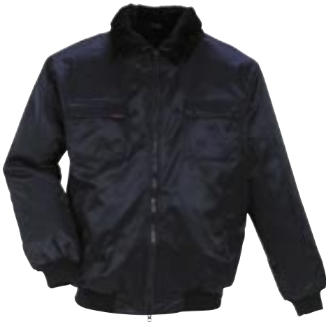
KITZBÜHL PILOT JACKET 00522-620

60% cotton/ 40% nylon. 240 g/m 2 . Pilot jacket in water-repellent Bearnylon® with pile lining, pile collar and quilted lining in sleeves. Two breast pockets with flaps. Size XS-4XL. Navy.