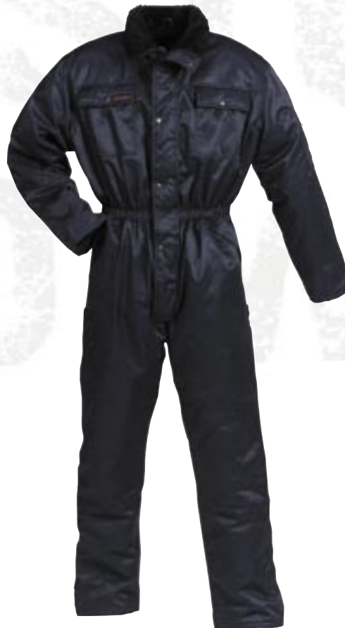
THULE WINTER BOILER SUIT 00517-620

60% cotton/ 40% nylon. 240 g/m 2 . Winter trousers in water-repellent Bearnylon® with quilted nylon lining. Two side pockets and back pockets. Size S-3XL. Inner seam 82 cm (32"). Navy.