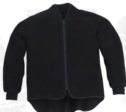
REYKJAVIK PILE JACKET 00508-710

95% polyester / 5% acrylic. 320 g/m 2 . Pile jacket that zips right through. Pile on the outside. Two large patch pockets. Size XS-4XL. Navy.