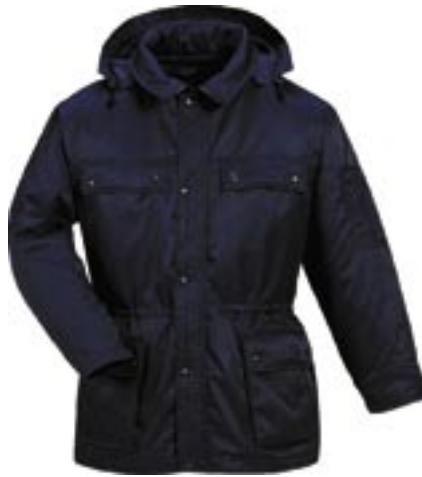
MONTREAL PARKA 00594-620

60% cotton/ 40% nylon. 240 g/m 2 . Pilot jacket in water-repellent Bearnylon® with pile lining, pile collar and quilted lining in sleeves. Two breast pockets with flaps. Size XS-4XL. Navy.