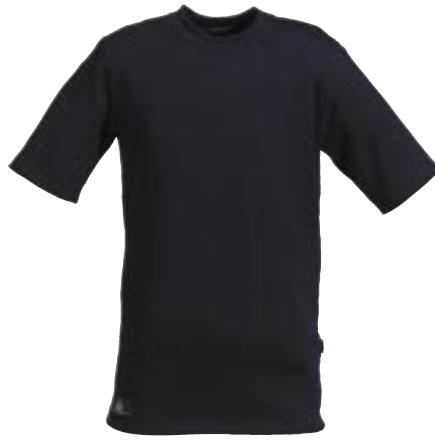
KUMLA THERMAL UNDERSHIRT 00797-380

55% polyester / 23% modal / 22% cotton. 260 g/m 2 . Triple-layer thermal undershirt made of Thermax® with turtleneck, short zip and long sleeves. Size S-3XL. Navy.