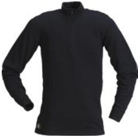
LUDVIKA THERMAL UNDERSHIRT 00596-380

55% polyester / 23% modal / 22% cotton. 260 g/m 2 . Triple-layer thermal undershirt made of Thermax® with turtleneck, short zip and long sleeves. Size S-3XL. Navy.