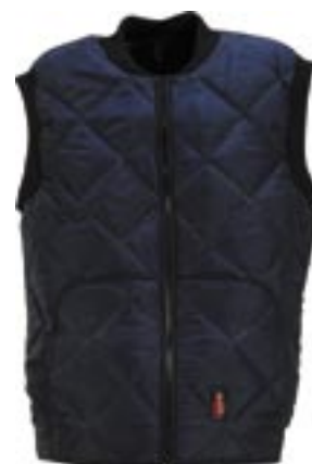
LIVERPOOL THERMAL BODYWARMER 00565-450

100% polyester. 250 g/m 2 . Quilted thermal jacket with rear protection. Two large patch pockets. Size XS-4XL. Navy.