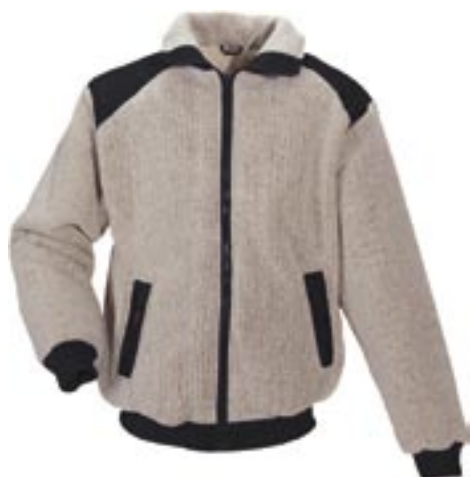
RIGA CLIMATIC PILE JACKET 00543-600

95% polyester / 5% acrylic. 370 g/m 2 . Climatic pile jacket that zips right through. Contrasting water-repellent Bearnylon® reinforcement at shoulders, outside collar, elbows and side pockets. Windproofed lining at sleeves. Size XS-4XL. Grey/navy, grey/red, grey/royal.