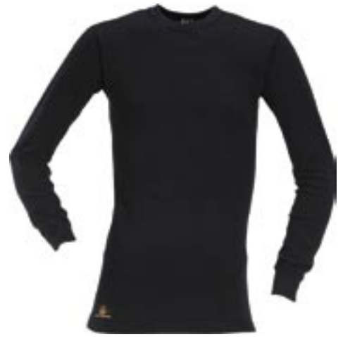
UPPSALA THERMAL UNDERSHIRT 00585-380

55% polyester / 23% modal / 22% cotton. 260 g/m 2 . Triple-layer thermal undershirt made of Thermax® with round neckline and short sleeves. Size S-3XL. Navy.