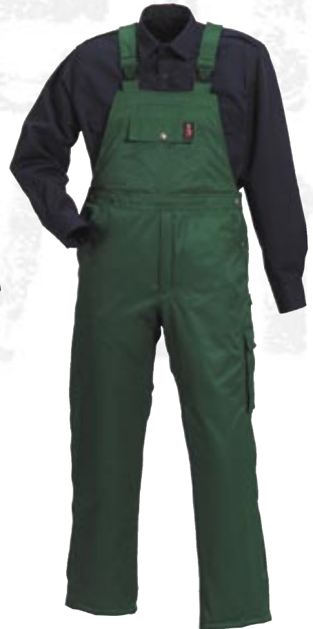
ANTARKTIS WINTER BIB & BRACE 00512-620

60% cotton/ 40% nylon. 240 g/m 2 . Winter boiler suit in water-repellent Bearnylon® with pile lining, pile collar and quilted leg lining. Access to trousers underneath. Size XS-5XL. Inner seam 82 cm (32") regular. Navy, red and royal.