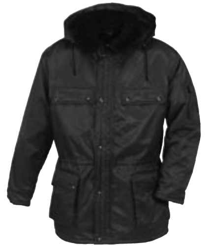
QUEBEC PARKA 00510-620

60% cotton/ 40% nylon. 240 g/m 2 . Parka in water-repellent Bearnylon® with quilted lining and pile collar. Detachable hood with quilted lining. Size XS-4XL. Navy, bottle green, black and royal.