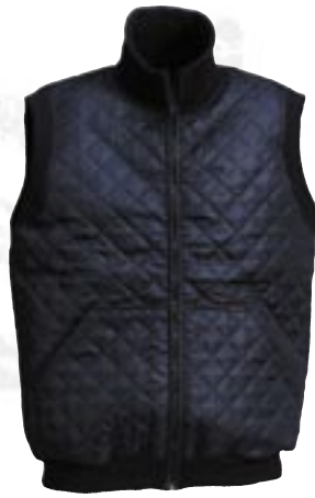
DUBLIN THERMAL BODYWARMER 02725-590

100% polyester. 250 g/m 2 . Quilted thermal jacket with rear protection and high collar in ribbed knit. Two large front pockets. Size XS-4XL. Navy.