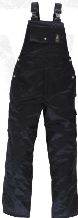
LECH WINTER BIB & BRACE 00592-650

100% polyester. 225 g/m 2 . Outer bib & brace in breathable, wind and waterproof Mascotex® with lining and taped seams. Certified according to ENV343. Size S-4XL. Inner seam 82 cm (32"). Navy.