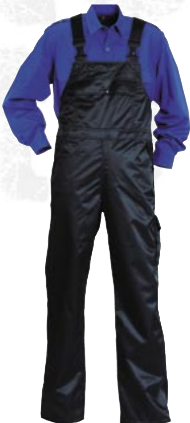
WILDON OUTER BIB & BRACE 07192-650

Rainy, windy weather can make anybody's life miserable, especially if water and cold are allowed to reach the body. Mascotex® was designed for rough weather. Specially taped seams make jackets and trousers 100% waterproof. The products are tested daily in workplaces all over Europe. The feedback is positive: Mascotex® keeps its promises.