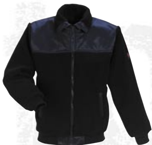
KLAKSVIK PILE JACKET 00547-710

MASCOT® ARCTIC also includes pile jackets and quilted thermal jackets and vests. All garments have zips right through and plenty of details. Thermal jackets and vests in quilted materials have ultra-sound welded seams for extra durability and to avoid broken threads.