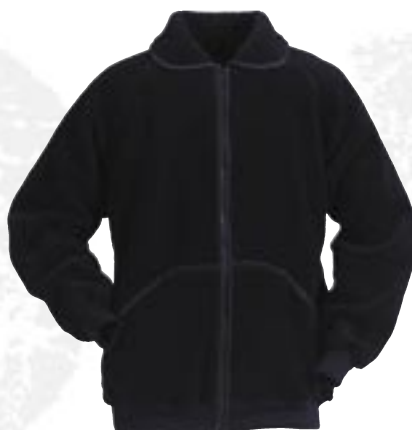
THORSHAVN PILE JACKET 00506-710

95% polyester / 5% acrylic. 320 g/m 2 . Pile jacket that zips right through. Pile on the outside. Water-repellent Bearnylon® reinforcement at shoulders, outside collar, elbows and side pockets. Windproofed lining at front and sleeves. Size XS-4XL. Navy.