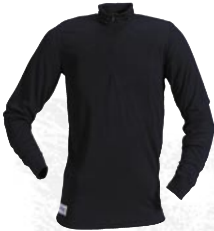
MOTALA THERMAL UNDERSHIRT 00595-350

If you want to keep the cold at bay, you have to begin with your underwear. MASCOT's perspiration-control CoolMax® and Thermax® underwear maintains the right body temperature regardless of the weather conditions. Coolmax® are single-layer thermal undergarments that transport moisture and perspiration. Thermax® are triple-layer thermal undergarments. The ribbed towelling channels perspiration away from the body and out to the cotton and modal fibres, which absorb perspiration.