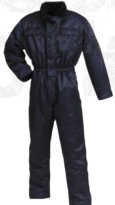
SAALBACH WINTER BOILER SUIT 00518-650

100% polyester. 225 g/m 2 . Winter bib & brace made of breathable, wind and waterproof Mascotex® with taped seams. Quilted lining. Adjustable waistband 5 cm; 1.97 inches). Certified according to ENV343. Size S-4XL. Inner seam 82 cm (32"). Navy.