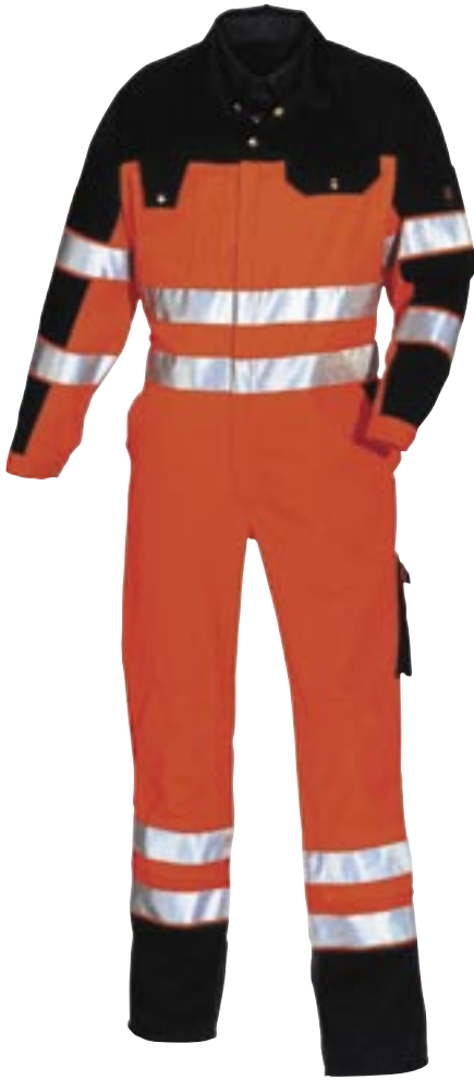
VERONA BOILER SUIT 00919-860

65% polyester / 35% cotton. 295 g/m 2 twill. Teflon®-treated. Two-tone high-visibility boiler suit with reflective tape and adjustable knee pad pockets. Access to trousers underneath. Certified according to EN471. Size C42-C72. Inner seam 82 cm (32"). Orange/navy.