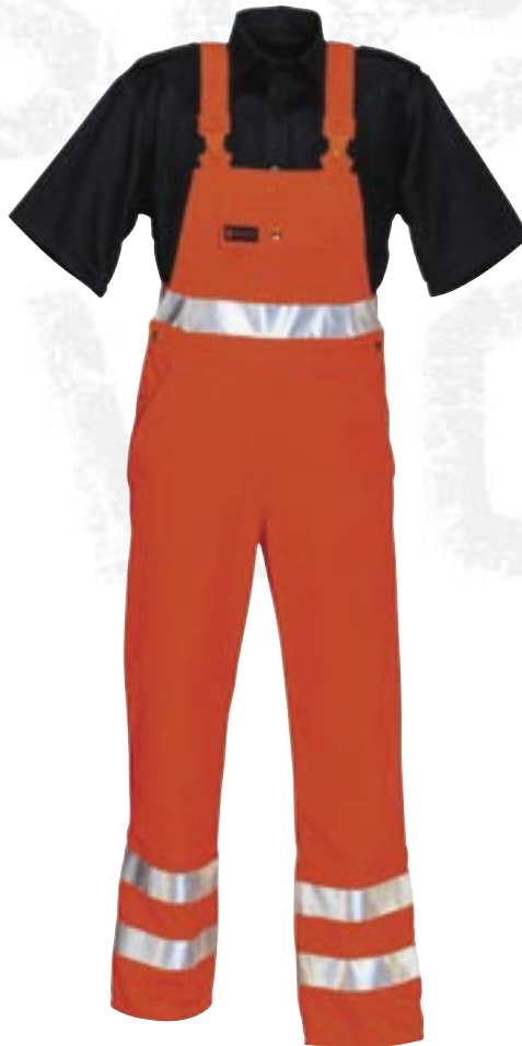
NEVADA BIB & BRACE 00569-860

65% polyester / 35% cotton. 295 g/m 2 twill. Teflon ® -treated. High-visibility boiler suit with reflective tape. Access to trousers underneath. Certified according to EN471. Size C42-C72. Inner seam 82 (32") and 90 cm (35"). Orange. Also available with knee pad pockets.