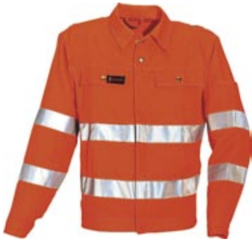
TEXAS WORK JACKET 00509-860

65% polyester / 35% cotton. 295 g/m 2 twill. Teflon ® -treated. High-visibility work jacket with reflective tape. Adjustable waist. Certified according to EN471. Size C42-C72. Orange