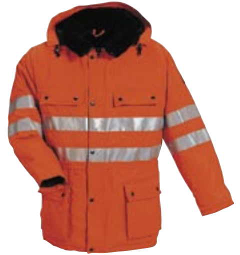
GRAZ PARKA 00533-880

80% polyester / 20% cotton. 220 g/m 2 twill. High-visibility parka with reflective tape. Water-repellent material. Quilted lining and pile collar. Detachable hood with quilted lining. Certified according to EN471. Size XS-4XL. Orange.