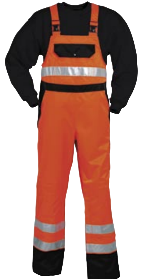
WELS OUTER BIB & BRACE 07092-880

65% polyester / 35% cotton. 295 g/m 2 twill. Teflon®-treated. Two-tone high-visibility bib & brace with reflective tape and adjustable knee pad pockets. Adjustable waistband (5 cm; 1.97 inches). Certified according to N471. Size C42-C72. Inner seam 82 (32") and 90 cm (35"). Size C42-C62 also available with inner seam 72 cm (28.5"). Orange/navy and yellow/navy.