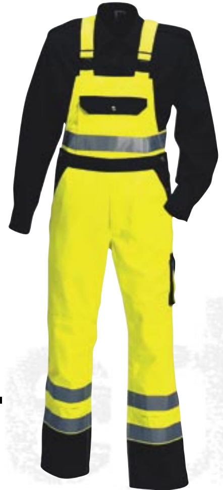
MILANO BIB & BRACE 00969-470

70% polyester / 30% cotton. 160 g/m 2 . High-visibility T-shirt with reflective tape and round neckline. Certified according to EN471. Size L-3XL. Orange and yellow.