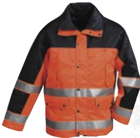
SAVONA JACKET 00930-880

100% polyester. 225 g/m 2 . Two-tone high-visibility jacket with reflective tape. Breathable, wind and waterproof Mascotex® with taped seams. Detachable quilted lining. Certified according to EN471 and EN343. Size XS-4XL. Orange/navy and yellow/navy.