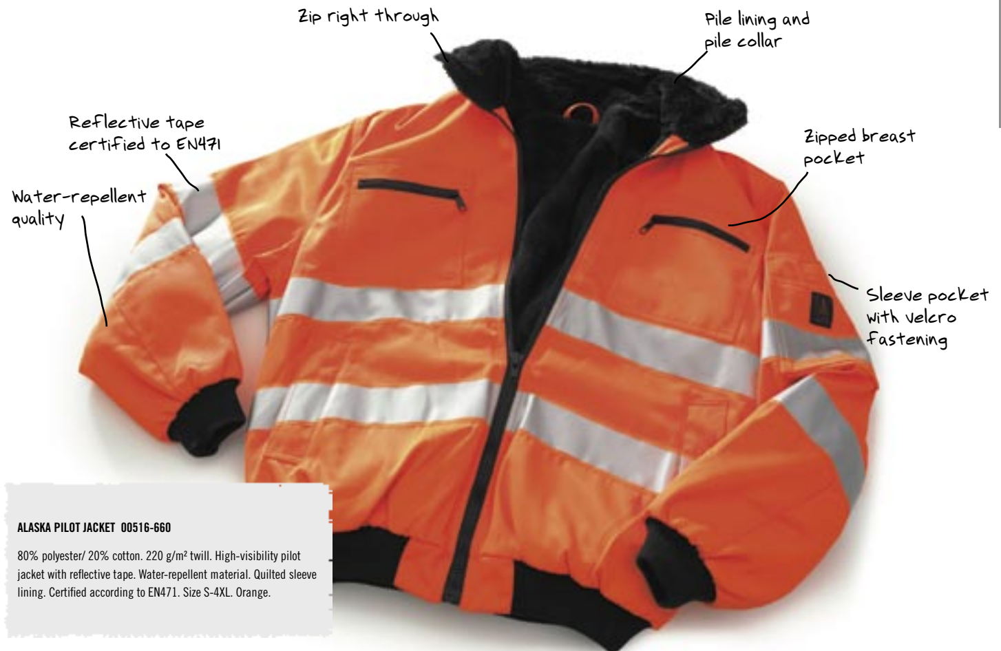
ALASKA PILOT JACKET 00516-660

80% polyester/ 20% cotton. 220 g/m 2 twill. High-visibility pilot jacket with reflective tape. Water-repellent material. Quilted sleeve lining. Certified according to EN471. Size S-4XL. Orange.