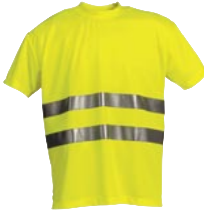
TENNESSEE T-SHIRT 00786-290

65% polyester / 35% cotton. 310 g/m 2 twill. Teflon®-treated. Two-tone high-visibility work jacket with reflective tape. Adjustable waist. Certified according to EN471. Size C42-C72. Orange/navy and yellow/navy.