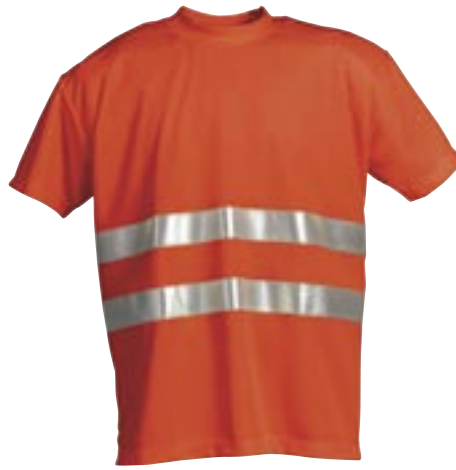
TENNESSEE T-SHIRT 00786-290

65% polyester / 35% cotton. 295 g/m 2 twill. Teflon ® -treated. High-visibility work jacket with reflective tape. Adjustable waist. Certified according to EN471. Size C42-C72. Orange