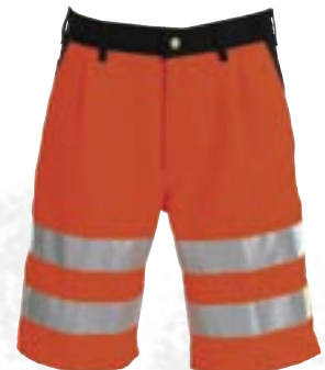
LIDO WORK SHORTS 00949-860

65% polyester / 35% cotton. 295 g/m 2 twill. Teflon®-treated. Two-tone high-visibility work jacket with reflective tape. Adjustable waist. Certified according to EN471. Size C42-C72. Orange/navy and yellow/navy.