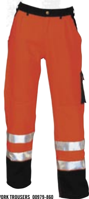
TORINO WORK TROUSERS 00979-860

The fluorescent material used for MASCOT® SAFE garments ensure optimum visibility and safety for the users. The many different styles available ensure comfort all year round.