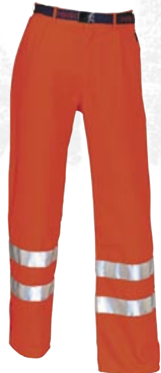
MONTANA WORK TROUSERS 00579-860

65% polyester / 35% cotton. 295 g/m 2 twill. Teflon ® -treated. High-visibility bib & brace with reflective tape. Adjustable waist-band (5 cm; 1.97 inches). Certified according to EN471. Size C42-C72. Inner seam 82 (32") and 90 cm (35"). Orange. Also available with knee pad pockets.