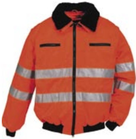
KAPRUN MULTI-PURPOSE JACKET 00535-880

100% polyester. 225 g/m 2 . High-visibility multi-purpose jacket with reflective tape. Breathable, wind and waterproof Mascotex® with taped seams. Detachable pile lining and pile collar. Detachable sleeves with quilted lining. Certified according to EN471. Size XS-4XL. Orange.