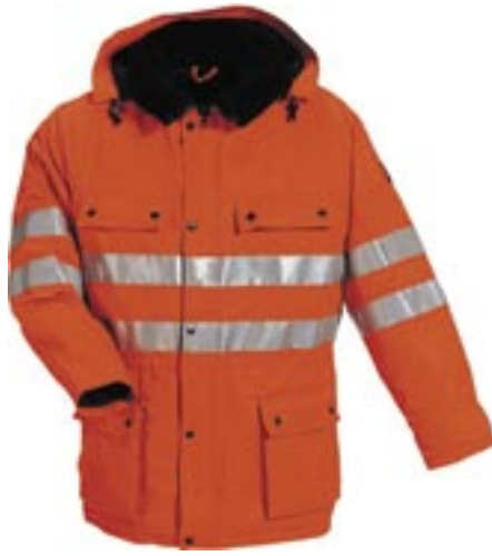
QUEBEC PARKA 00510-660

100% polyester. 225 g/m 2 . High-visibility multi-purpose jacket with reflective tape. Breathable, wind and waterproof Mascotex® with taped seams. Detachable pile lining and pile collar. Detachable sleeves with quilted lining. Certified according to EN471. Size XS-4XL. Orange.