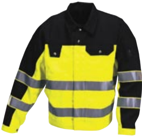
COMO WORK JACKET 00909-470

65% polyester / 35% cotton. 310 g/m 2 twill. Teflon®-treated. Two-tone high-visibility work jacket with reflective tape. Adjustable waist. Certified according to EN471. Size C42-C72. Orange/navy and yellow/navy.