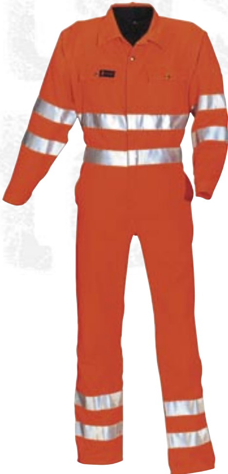
KENTUCKY BOILER SUIT 00519-860

65% polyester / 35% cotton. 295 g/m 2 twill. Teflon ® -treated. High-visibility boiler suit with reflective tape. Access to trousers underneath. Certified according to EN471. Size C42-C72. Inner seam 82 (32") and 90 cm (35"). Orange. Also available with knee pad pockets.