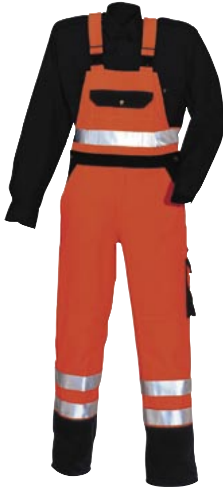
MILANO BIB & BRACE 00969-860

65% polyester / 35% cotton. 295 g/m 2 twill. Teflon®-treated. Two-tone high-visibility boiler suit with reflective tape and adjustable knee pad pockets. Access to trousers underneath. Certified according to EN471. Size C42-C72. Inner seam 82 cm (32"). Orange/navy.