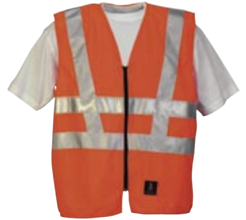
COLORADO TRAFFIC WAISTCOAT 00787-310

70% polyester / 30% cotton. 160 g/m 2 . High-visibility T-shirt with reflective tape and round neckline. Certified according to EN471. Size L-3XL. Orange and yellow.