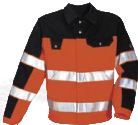
COMO WORK JACKET 00909-860

100% polyester. 225 g/m 2 . Two-tone high-visibility jacket with reflective tape. Breathable, wind and waterproof Mascotex® with taped seams. Detachable quilted lining. Certified according to EN471 and EN343. Size XS-4XL. Orange/navy and yellow/navy.